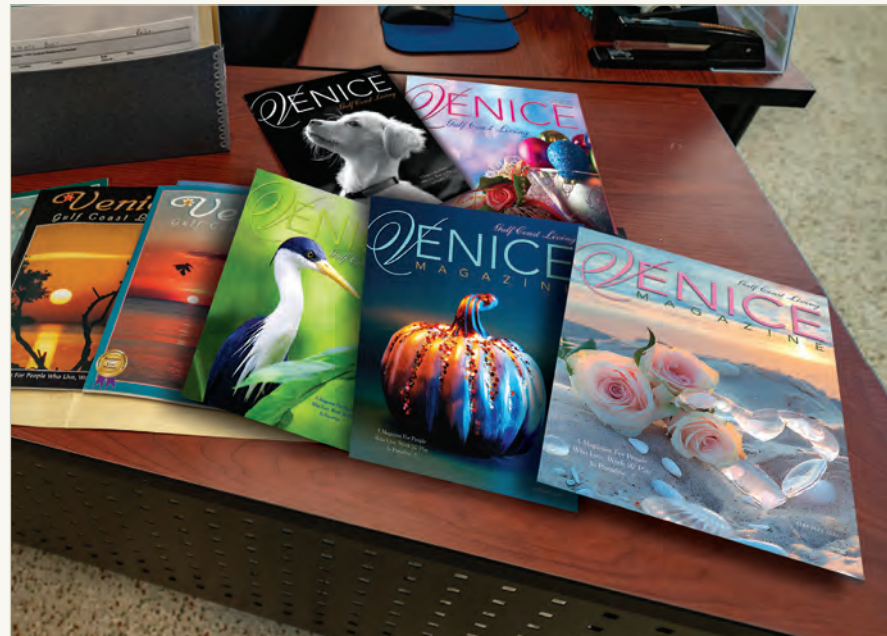
Venice Gulf Coast Living Magazine is included in the Venice Archives Collection

Whether you're a history enthusiast, a curious visitor, or a proud local, the Venice Museum and Archives offers a chance to connect with the stories that define this unique community.